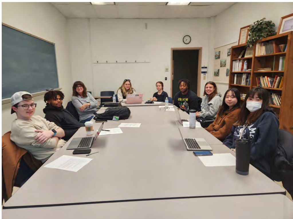
Big Blue weekly staff meeting

The Big Blue Practicum is a laboratory for students who would like to put their business-related skills into practice and acquire new skills while maintaining a high-functioning non-profit business organization.