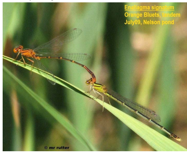
Figure 1. Enallagma signatum