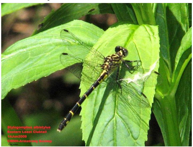
Figure 3. Stylogomphus albistylus

Black Saddlebags- Tramea lacerata 9Jun-23Sep 16