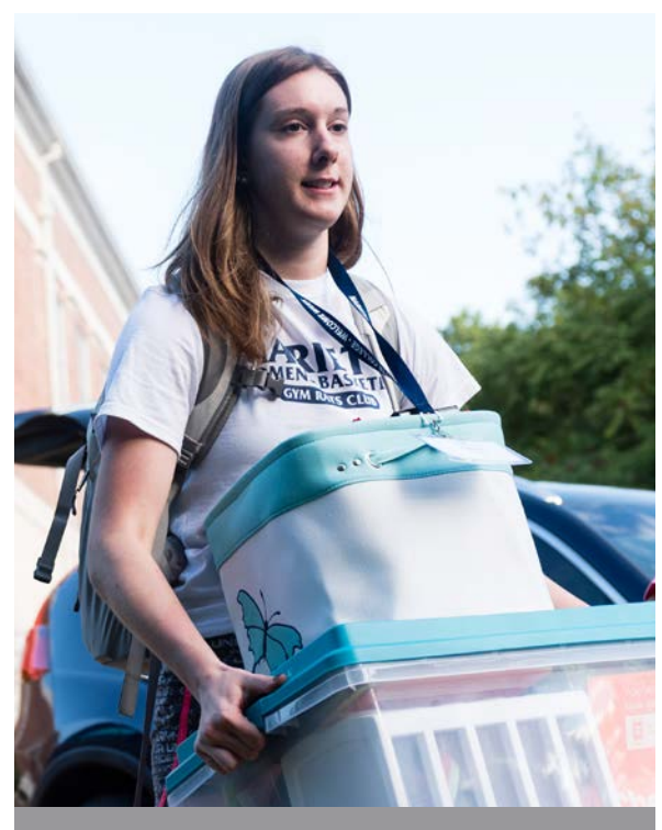
And remember: when in doubt, leave it out!

All rooms are furnished with a desk, chair, bed with an extralong twin mattress, a closet, dresser, WiFi Connection and cable television access. Dimensions of the rooms will vary in size from hall to hall and room to room. We recommend that you wait until after you arrive on campus to consider buying large rugs or other measurable decorative items.