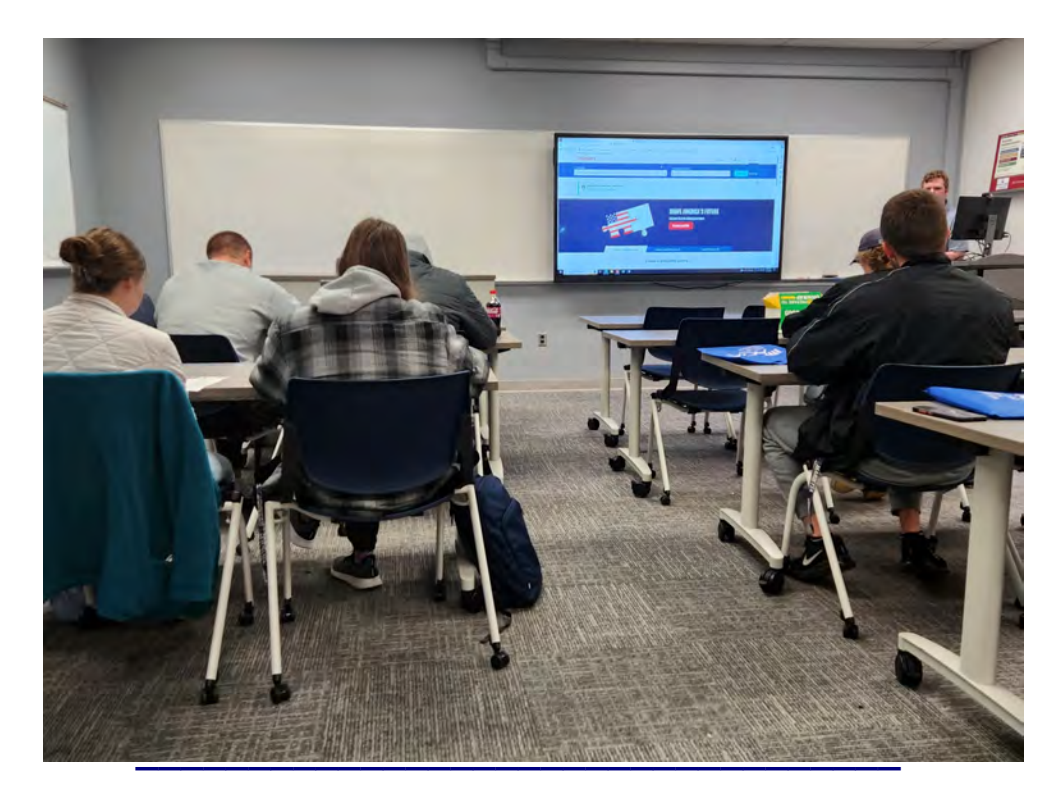
February 15, 2024: Speed Mock Interview