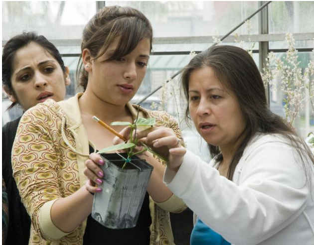
California State University, Los Angeles

54% of FY students at least occasionally spent time with faculty members on activities other than coursework.